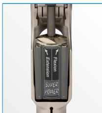
Adaptable swing phase