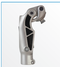
Large 145° flexion range