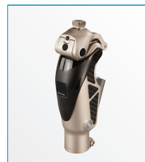
Knee protection cap